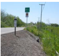
Sonoma Marin County line...Marin banned RoundUp